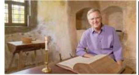
Travel guide and Lutheran Rick Steves is helping Lutherans explore the Reformation, our church history and faith.

Steves' "Luther and the Reformation" is airing throughout 2017. It's available to watch online at ELCA.org/ricksteves , along with resources for hosting congregational screenings of the film, including ELCA discussion points and study questions, a special introductory video from Steves, and art and video clips to promote your event. DVD copies of the special have also been sent to every ELCA congregation.